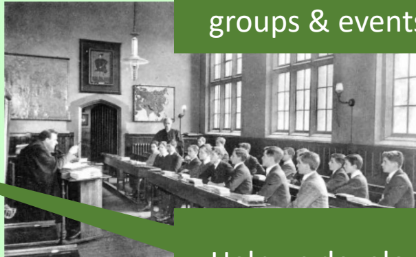
Interior of Big School More about this photo