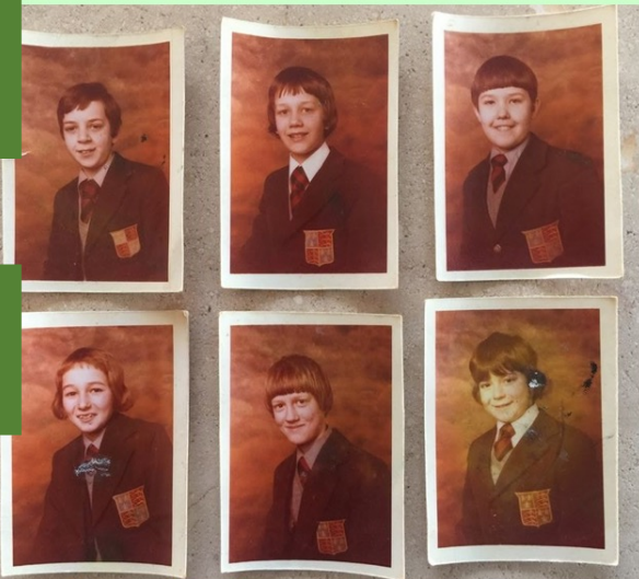
More about this photo..